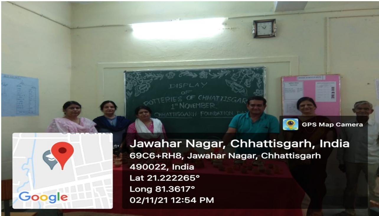
Celebrating Chhattisgarh Foundation Day - 1 Nov 2021