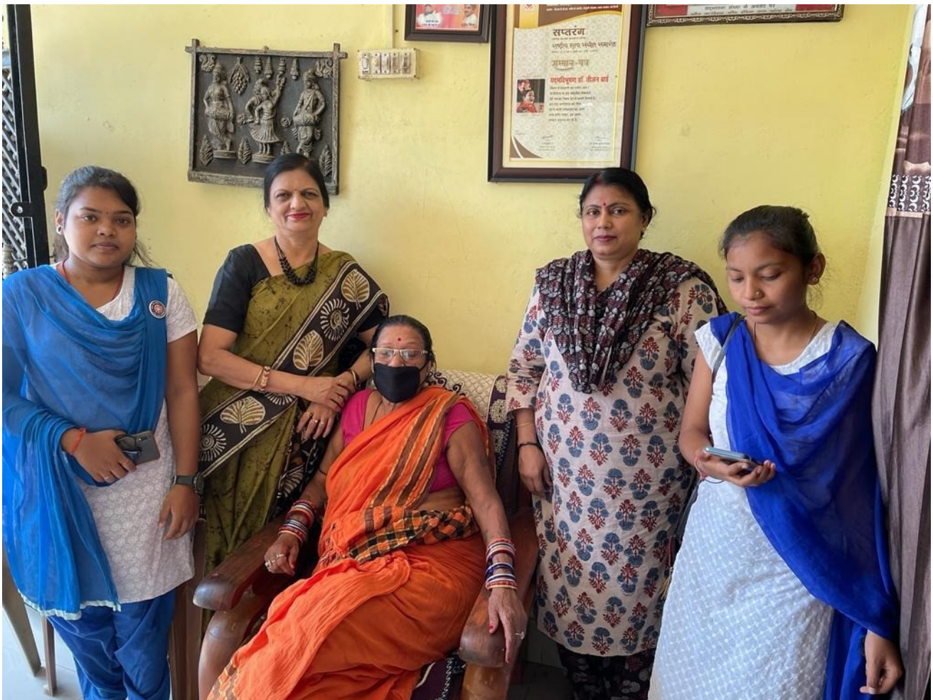
Interaction with PadmShri Teejan Bai - Well known Pandwani Singer of Chhattisgarh