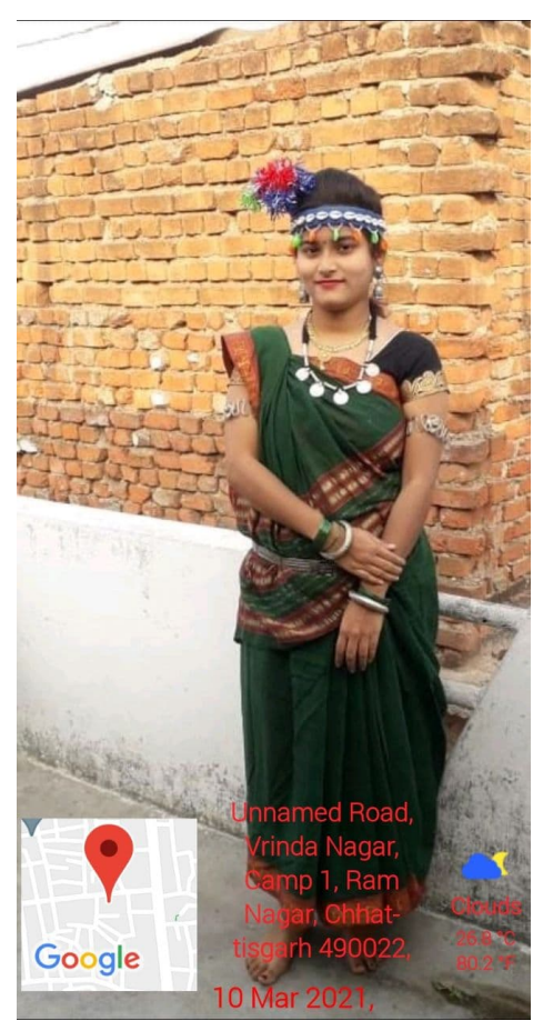
Display of Chhattisgarhi Costume - 10 March 2021